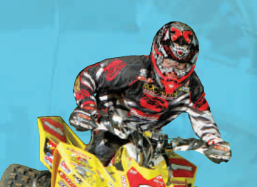
Recapping Another Great Year in Maxxis ATV Racing