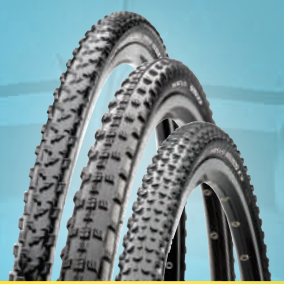
For the Demands of Cyclocross, Rely on Maxxis pg. 2