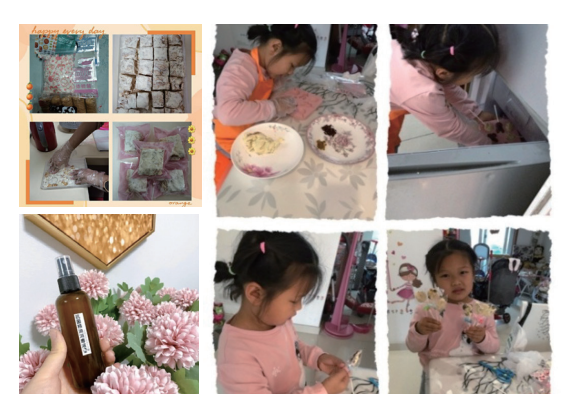
Mainland region-due to the epidemic, staff activities were held online. Include homemade snowflake pastry,DIY essential oil disinfectant, DIY lollipop,etc.

In 2020, due to the impact of the epidemic, a series of "online activities" were organized, that is, receiving goods and materials offline, teaching production methods online, and operating at home by employees to enrich their own lives.